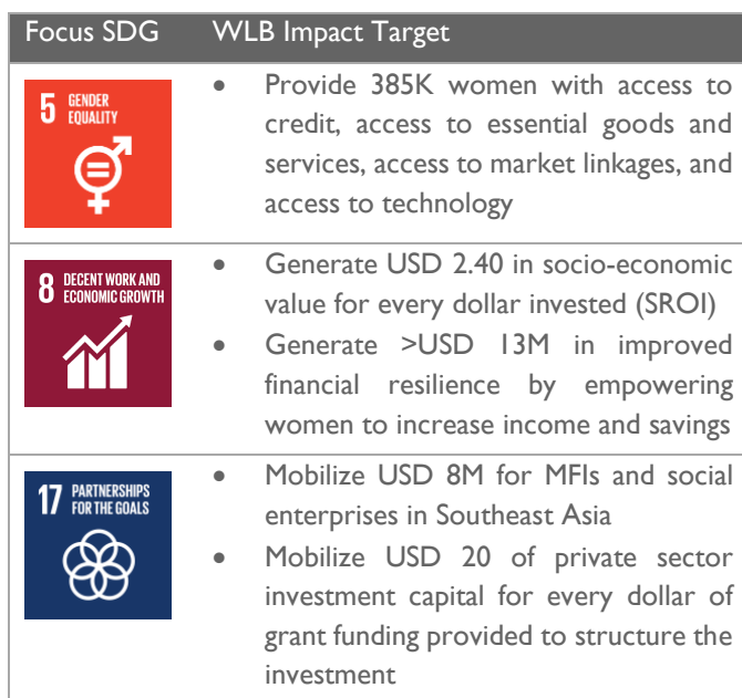
Table 3: Alignment between WLB impact metrics and the SDGs

One unique impact metric measured by the WLB is the Social Return on Investment (SROI). As developed by Social Value UK, SROI is a relatively new tool for measuring and communicating the volume, or value, of impact created by strategic investment dollars. Like traditional return on investment (ROI) analysis, SROI is a cost-benefit calculation that establishes a ratio between the inputs and the measured outputs or outcomes. Based on initial calculations, the WLB will have a weighted average SROI of 2.4 across its three investments. In other words, IIX anticipates USD 2.40 in measurable impact (e.g., increased income and/or savings) for every dollar invested by the WLB.